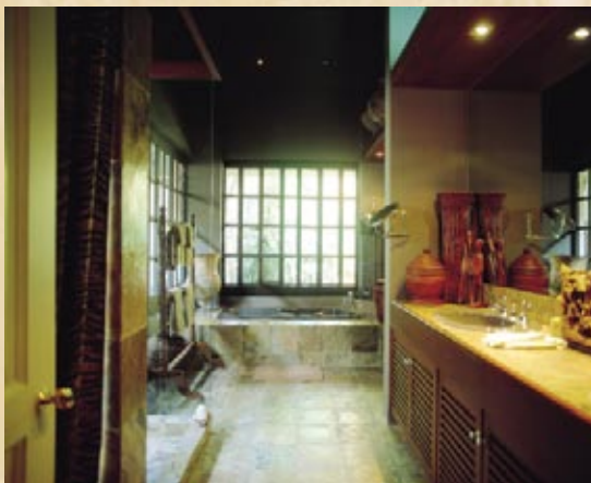
May you be healthy, happy, and in control of the germs.

To be safe, wet a paper towel with rubbing alcohol and wipe it down. Alcohol disinfects and evaporates, so that leftover liquid won’t damage the device.